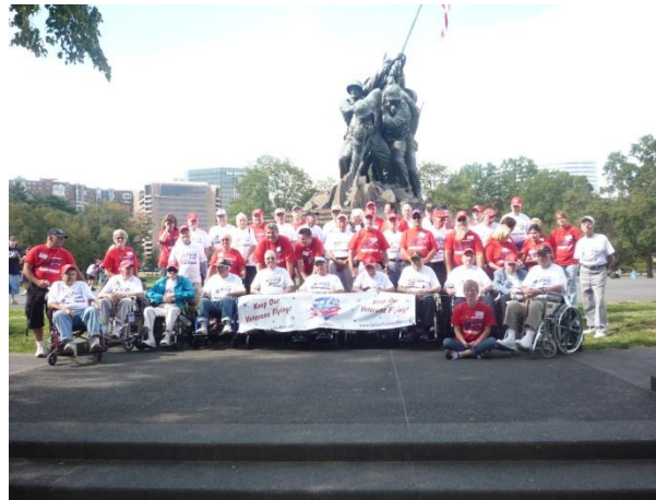
Honor Flight Buffalo's Second Flight September 11 th , 2010

If you can read this thank a teacher. If you can read this in English, thank a WWII veteran before it's too late!