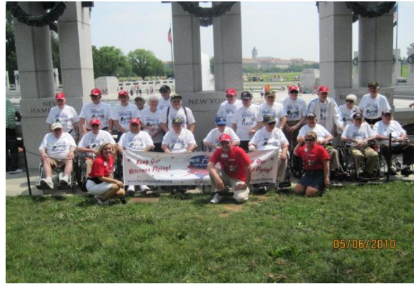
Honor Flight Buffalo's First Flight June 5 th , 2010

"We can't all be heroes. Some of us have to stand on the curb and clap as they go by." - Will Rogers